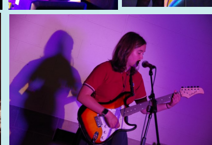
Covid may have prevented a live audience but it certainly didn't stop these performers from shining.