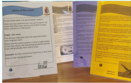
Drop everything and read