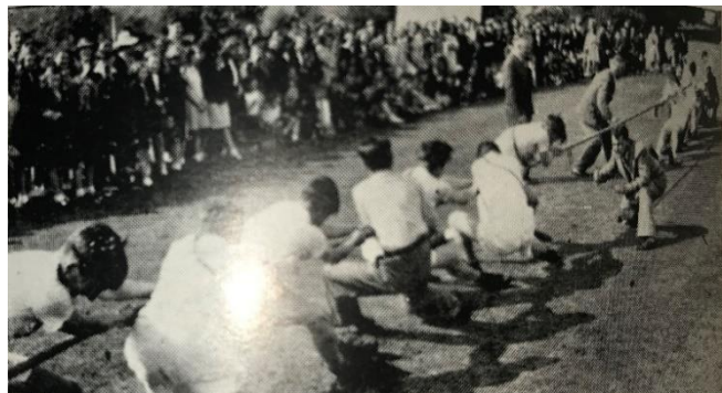
A tug of war between Wilbraham and Thrush during sports day.