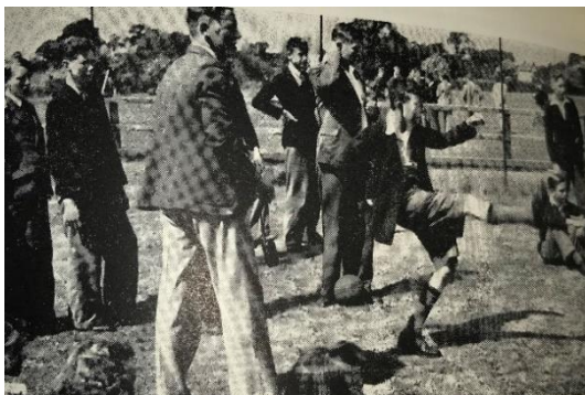
A picture from a garden party with students from both Oldershaw and Nantwich and Acton Grammar School.

competition resumed after the end of the Second World War.