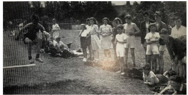
Long jump at sports day