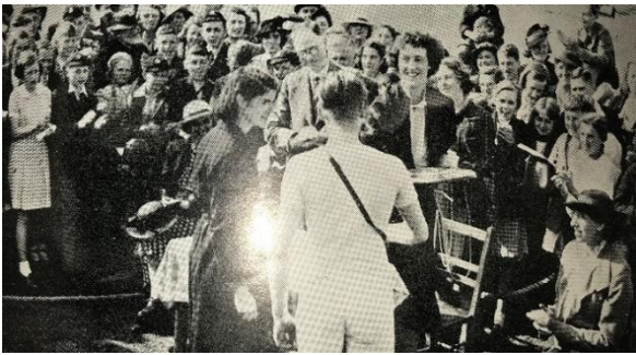
Trophy presentation at sports day